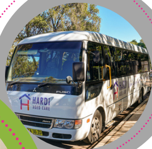
Above: Residents enjoy a Hardi bus outing

Hardi has its own mini bus, and residents enjoy regular day trips or outings on the bus for morning or afternoon teas to various destinations around greater Sydney.