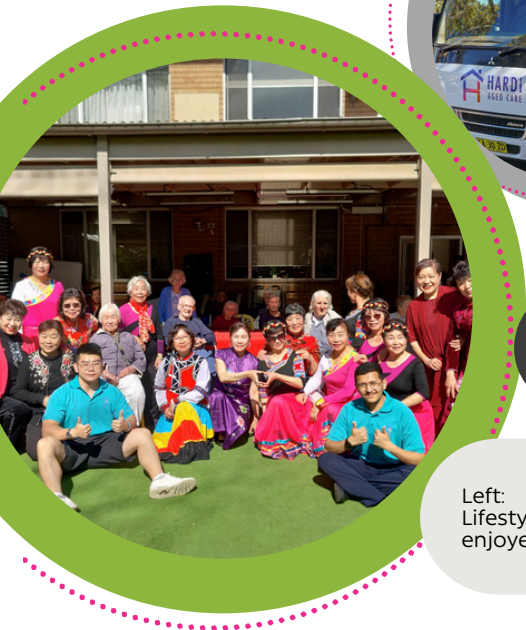
Left: Lifestyle activities enjoyed by residents